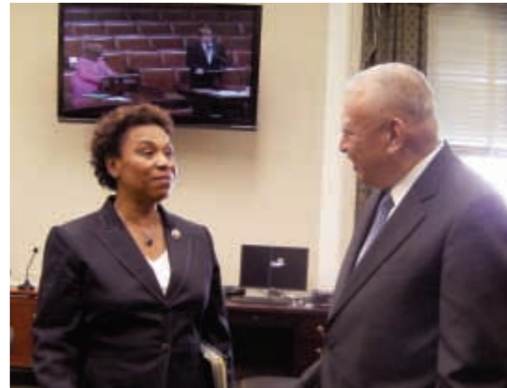
Foundation Chairman, Mr. C.H. Tung (right) meets with the Chairlady of the Congressional Black Caucus, Ms. Barbara Lee (left)

Mr. Tung was invited to speak at the Carnegie Endowment for International Peace, the Council on Foreign Relations, the EastWest Institute (EWI) and the AEA Investors Annual Meeting Dinner. During these visits he shared with audiences his insights on the importance of building strategic trust and mutual understanding between the two countries. For the full text of Mr. Tung's speeches, please visit www.cusef.org.hk