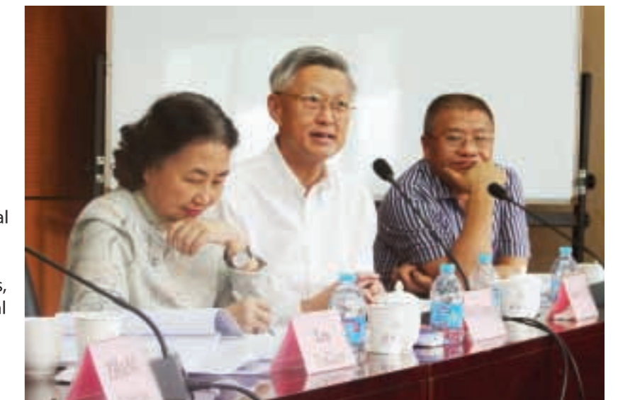
Foundation Governor, Ms. Elsie Leung (left) and HKSAR Chief Justice Andrew Li Kwok-nang (center) attend the China-U.S. Rule of Law Dialogue Program

The Foundation facilitated the engagement of a group of Chinese and American legal experts through a study program to discuss the development of China's rule of law. The first round of dialogues between the two sides took place in Beijing from July 29 to 30, 2010. Foundation Governor, Ms. Elsie Leung delivered the Opening Remarks on how the bilateral dialogue can help improve understanding of the Chinese legal and judicial systems. Topics discussed during this two-day program included the development of the Chinese legal system over the past six decades, Chinese constitutional law, the Chinese judicial system and judicial reform, criminal justice, legal education and WTO-related legal issues. A second round of dialogues is scheduled to take place sometime next year.