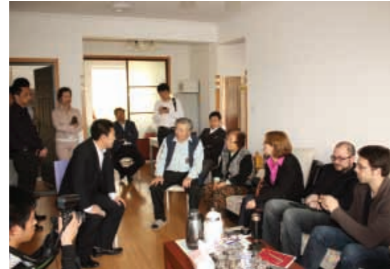
U.S. journalists on a tour of China's economic development visit a family in Dalian, Liaoning Province

Both groups also took the opportunity to visit the Shanghai World Expo. At the end of the visit, the journalists met with Foundation Chairman, Mr. C.H. Tung in Beijing.